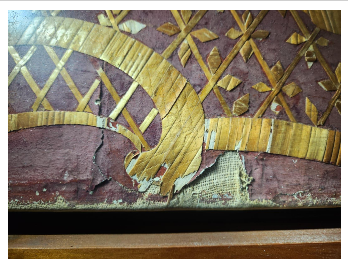
Detail of tears and losses in the paper support, and losses in the pieces of straw.