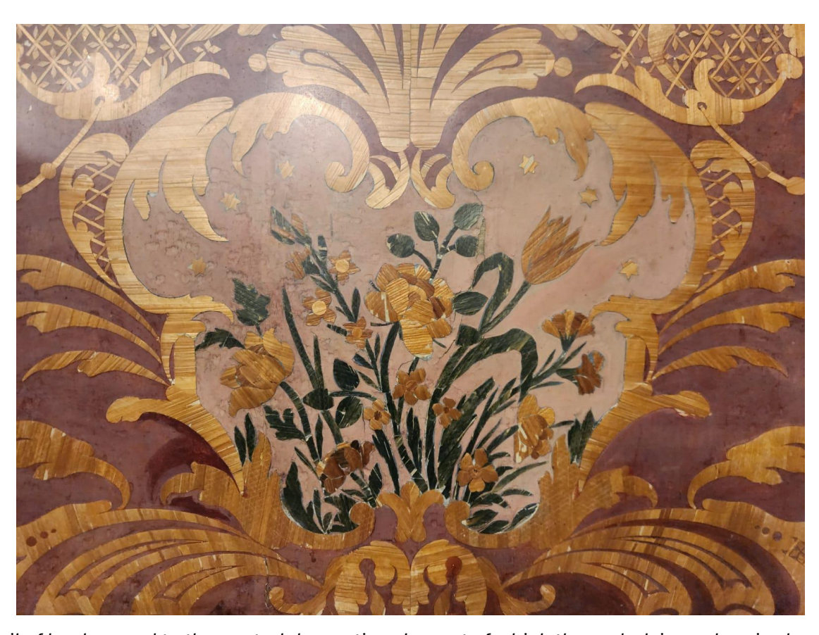
Detail of background to the central decorative element of which the underlying colour is showing.