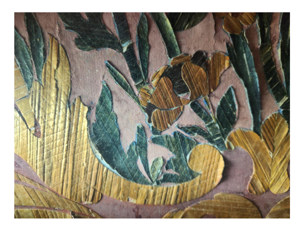
Detail of the pieces of straw that are bending and detaching from the paper support.