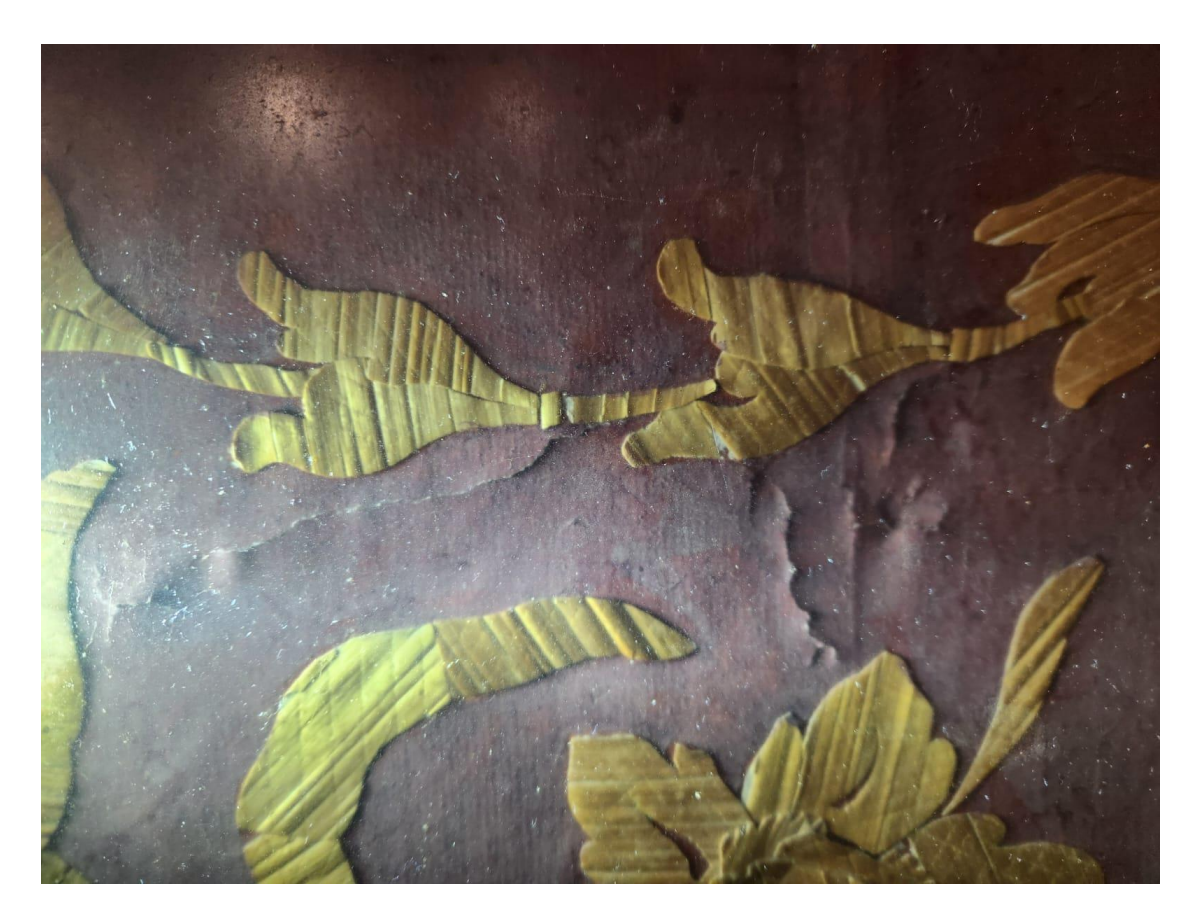
Detail of tears in the paper support.