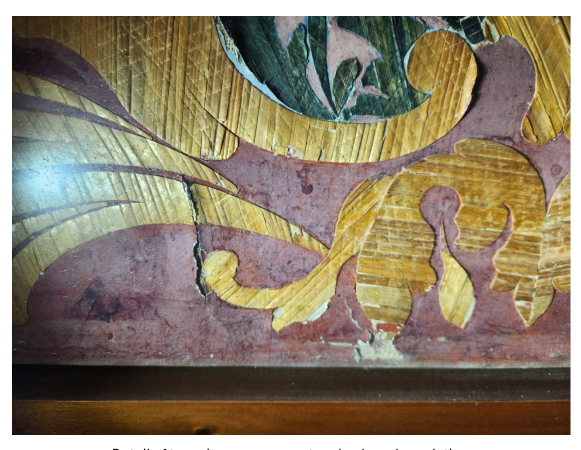
Detail of tears in paper support and colour degradation.