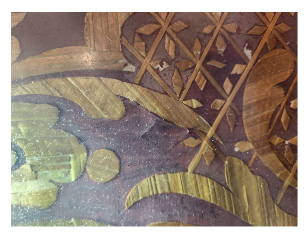
Detail of the tears in the paper support.