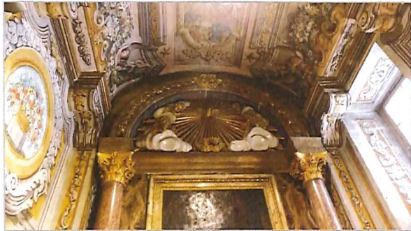
The Chapel of St Joseph

The chapel of the Archbishop's Palace is found next to the Throne Room, indicating that the bishop, later archbishop, would occasionally be accompanied by guests in prayer or at mass. Its walls are decorated in the trompe l'oeil technique. This technique was mastered by Maltese craftsmen, whose skill was highly sought, especially in the eighteenth-century for the decoration of churches in the high baroque style.