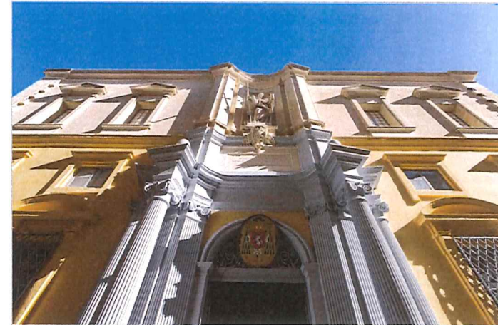
THE ARCHBISHOP'S PALACE, VALLETTA

As a Renaissance palace, belonging to the head of the Maltese diocese, the Archbishop's Palace served both as an administrative centre for the Roman Catholic church in Malta as well as a residence for its Bishop. The residential wing was also intended for hosting high-ranking guests, reflecting Renaissance and Baroque tastes of the seventeenth and eighteenth centuries.