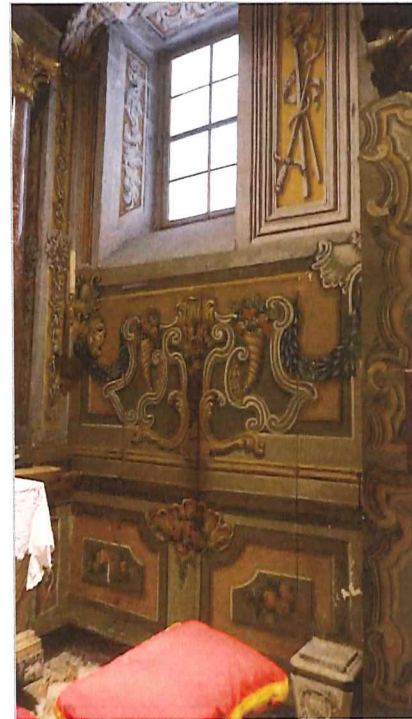
Decorated Wall Cabinet