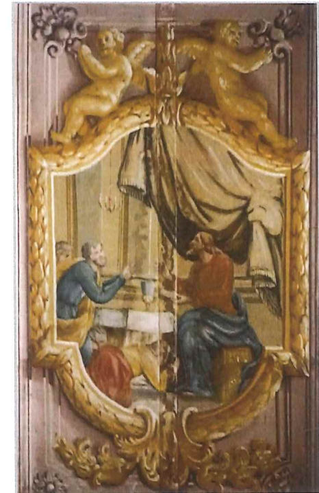
Ceiling painting: Mary Magdalen washing the feet of Christ