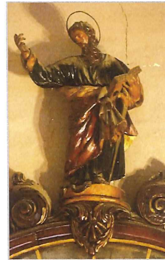
Polychrome statue: St Paul