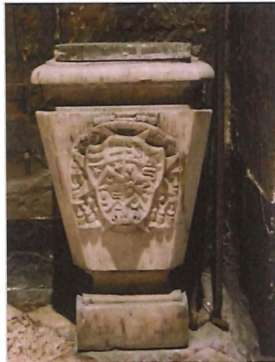
Holy Water Stoup, marble