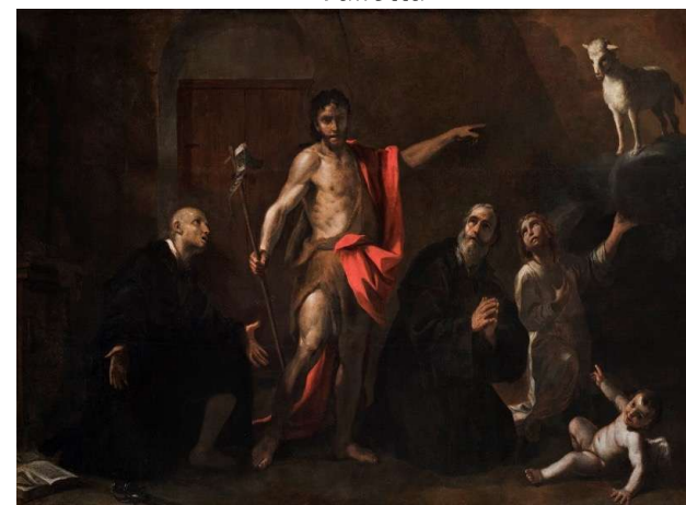
The Bless Raymond and Gerard kneeling before the Lamb of God, Mattia Preti, St John Co-Cathedral, Valletta