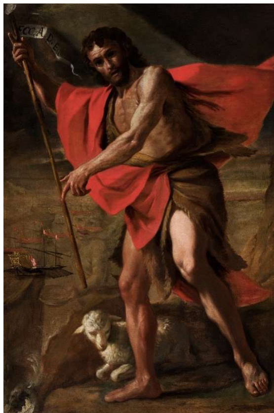
Saint John The Baptist, Mattia Preti, Archbishop Curia, Floriana

ATELIER DEL RESTAURO CONSERVATION & SCIENTIFIC ANALYSIS OF WORKS OF ART