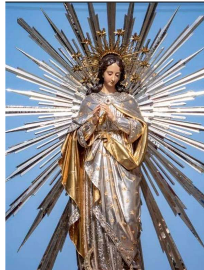
The Titular statue of the Immaculate Conception at the Collegiate Church of Cospicua.