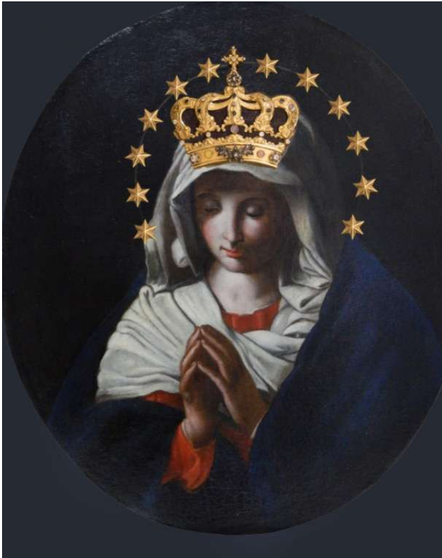
Our Lady of Good Health, Rabat