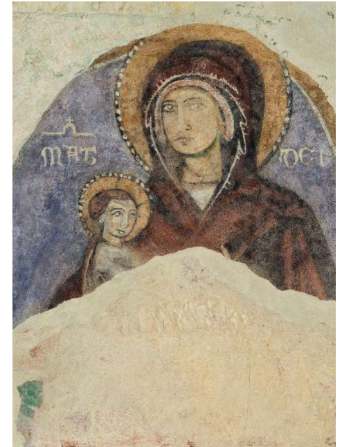
The wall painted Virgin representing the Odigitra Style, known as Our Lady of Mellieha found inside the semi-hypogea rock cut church Sanctuary of Our Lady of Mellieha