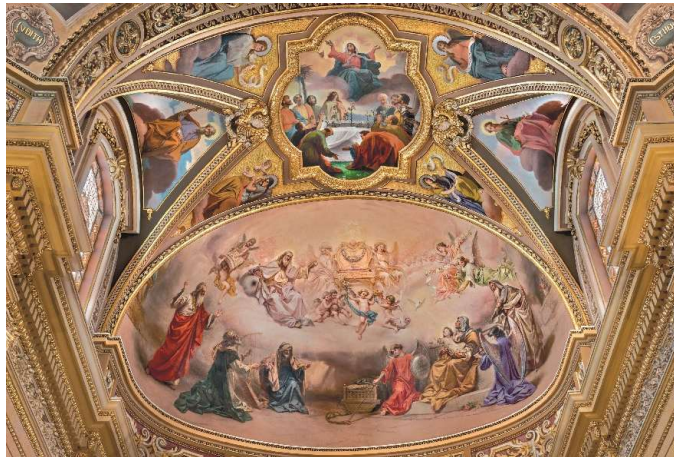
The wall painted apse at the Collegiate Basilica of Xaghra dedicated to the Nativity of the Blessed Virgin.