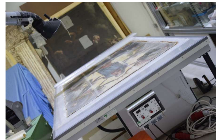
Low pressure table