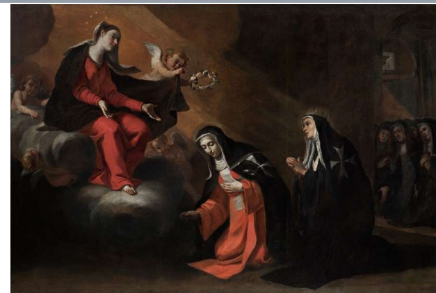
Santa Flora & Donna Sancha before the Virgin Mary, Mattia Preti, St John Co-Cathedral, Valletta

ATELIER DEL RESTAURO CONSERVATION & SCIENTIFIC ANALYSIS OF WORKS OF ART