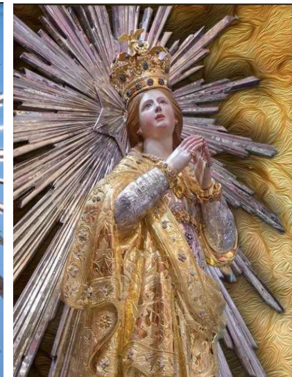
The Titular statue of Maria Bambina, Senglea Basilica dedicated to the Nativity of the Virgin.