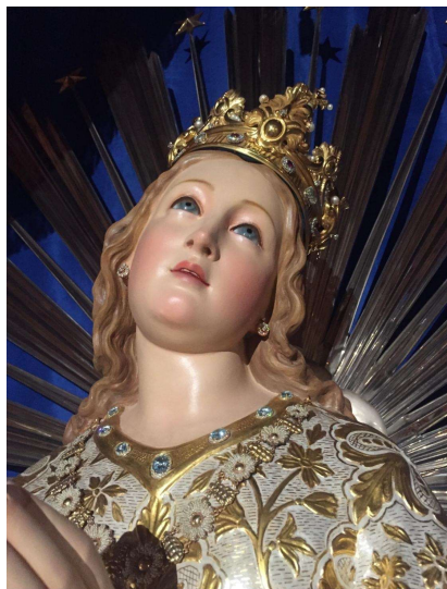
The Titular statue of Maria Bambina, Xaghra Basilica dedicated to the Nativity of the Virgin. Gozo.