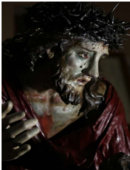
Christ the Redeemer ' Ir-Redentur tal-Isla' Senglea Basilica dedicated to the Nativity of the Virgin.