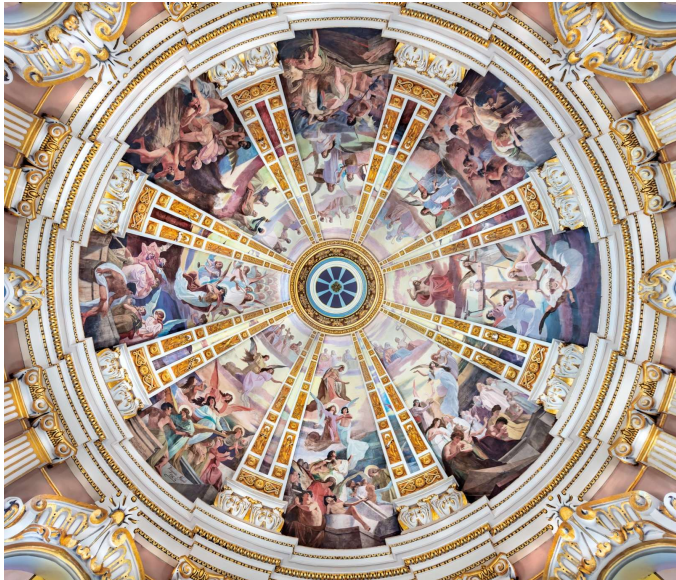
The main frescoed Dome representing the Triumph of the Holy Cross at the Collegiate Basilica of Birkirkara. Painted by Virginio Monti