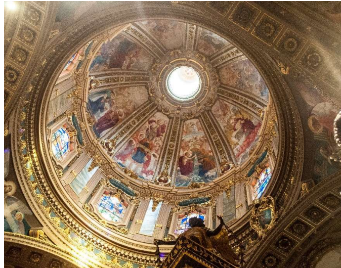
The Cupola of the St George's Basilica in Gozo painted by artist Gian Battista Conti.