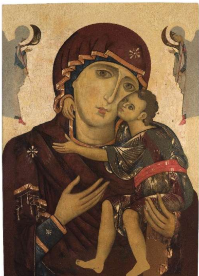
Our Lady of Damascus ' Damascena' Greek Catholic Church, Valletta