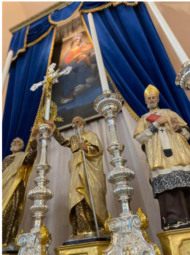
Sample of tree from the set of six

The Papier Mache gilded statues set are typical of Maltese religious artefacts, typical of the period. The structure is still in very good conservation state, the gilding has aged and the gilded bases in some areas the deterioration is very high. In fact, there was gesso which is flaking and had to be treated. In some other areas, some cracks and missing gesso and missing wood ornate is visible, but they can be conserved. The head, hands and feet are made of clay infact there is few missing fingers which must be reproduced. The dresses are made of fabric covered in gesso and gilded with the sgraffito technique and then painted with oil base colour. They need to be cleaned and retouching is need in missing areas.