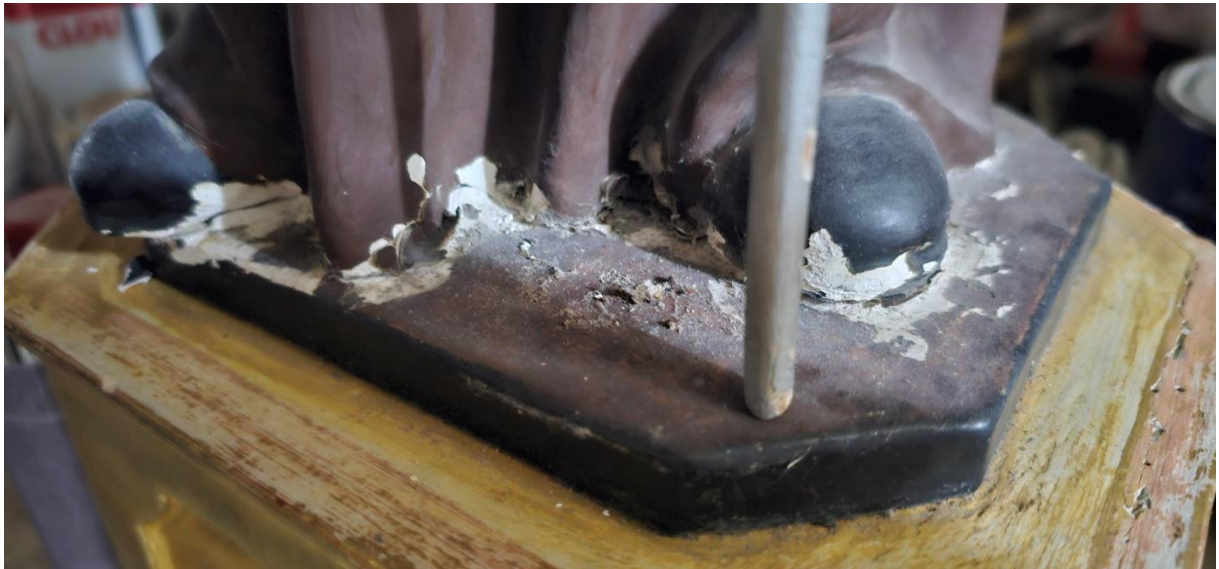
Detachment of the figure from the base