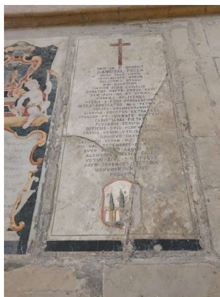
Photograph 2-6: General view of each marble slab.