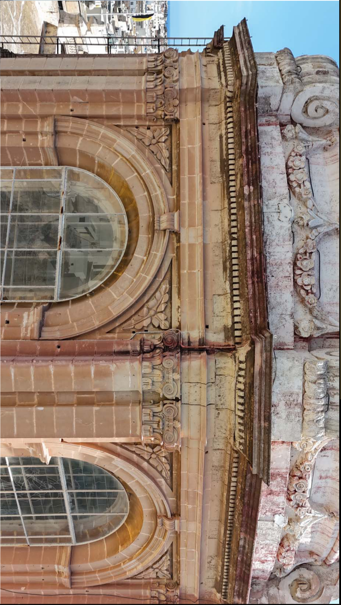
View 3 - from the West